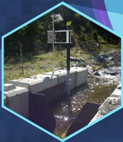
AQUAHIVE SMART MONITORING STATION Stream flow monitoring station. Other configurations available.