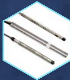
SENSORS Universal compatibility with multiple sensor types