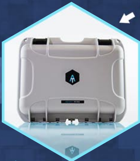
AQUAHIVE TERMINAL Your connection to the cloud using satellite, cell, or radio.