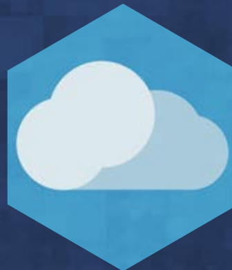
AQUAHIVE CLOUD STORAGE Elastic secure cloud storage.